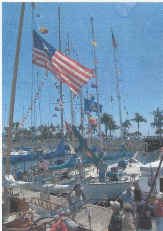
A Favorite Corner at the Show

No matter. It was time for a boat show. The new docks were in place, and a gangway was positioned to guide visitors down to a big fleet of classic boats, which arrived just before Father's Day weekend.