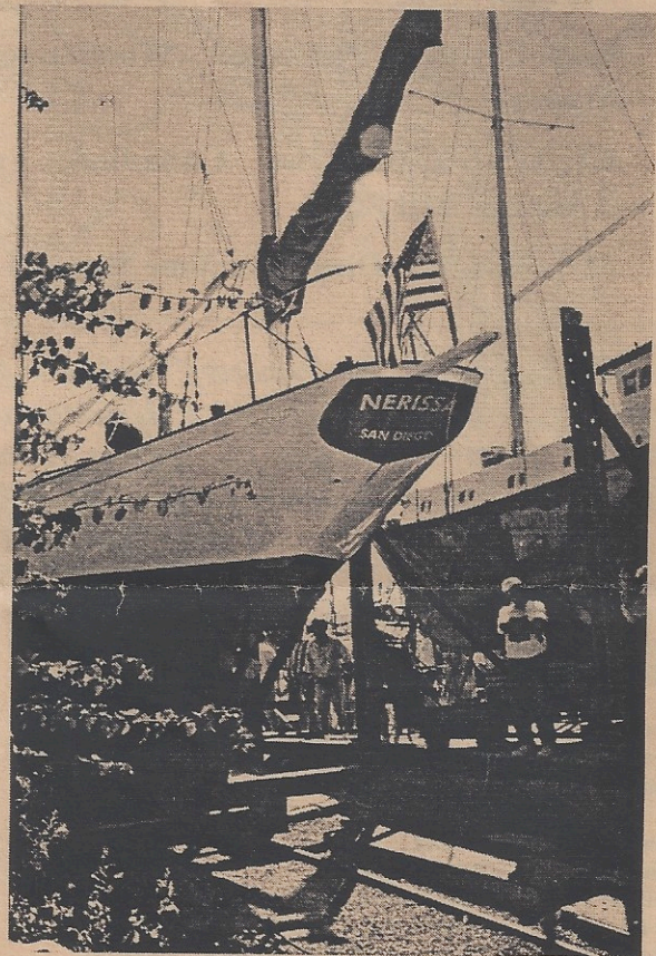
NERISSA's Relaunching in August 1999