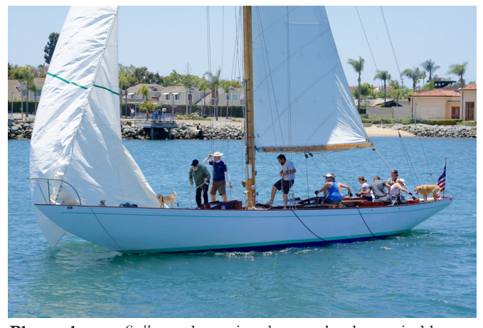
Photo above: Sally sets her spinnaker on the downwind leg of the 2015 Margarita Cup Race. Photo right: Notwithstanding a valiant swim-then-sprint finish by Rendezvous ' "swimmer," she missed a first by mere seconds. Again! Who needs minutes anyway?