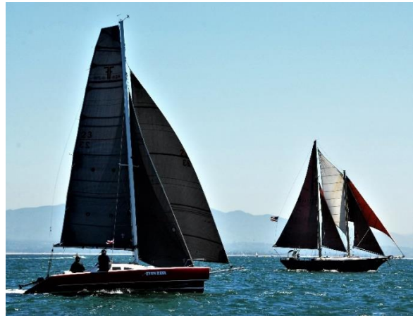
AGE OF GRACE