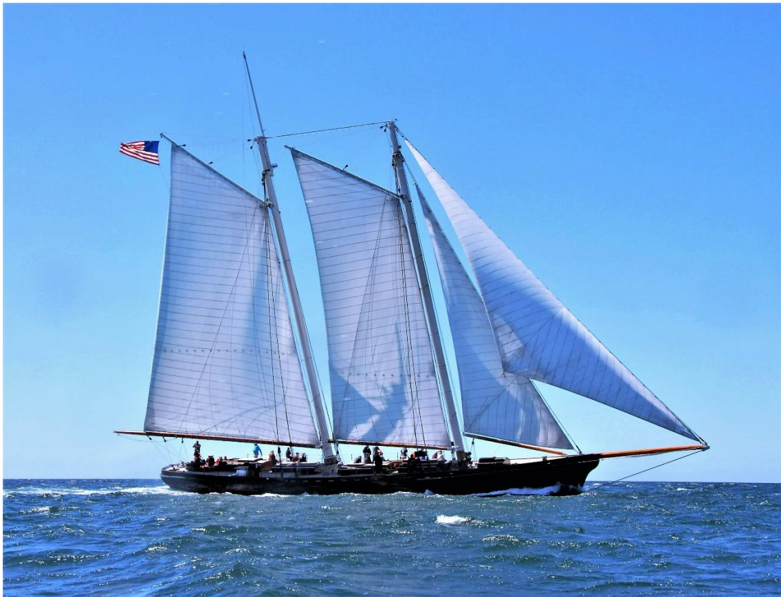
AMERICA NEXT LEVEL SAILING 2021