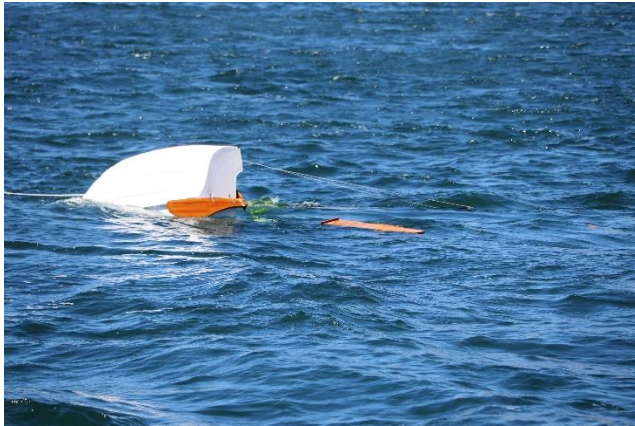
LIME AN DE COCONUT Janie Allan