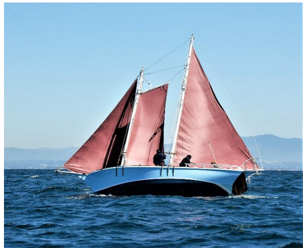
MAID OF KENT