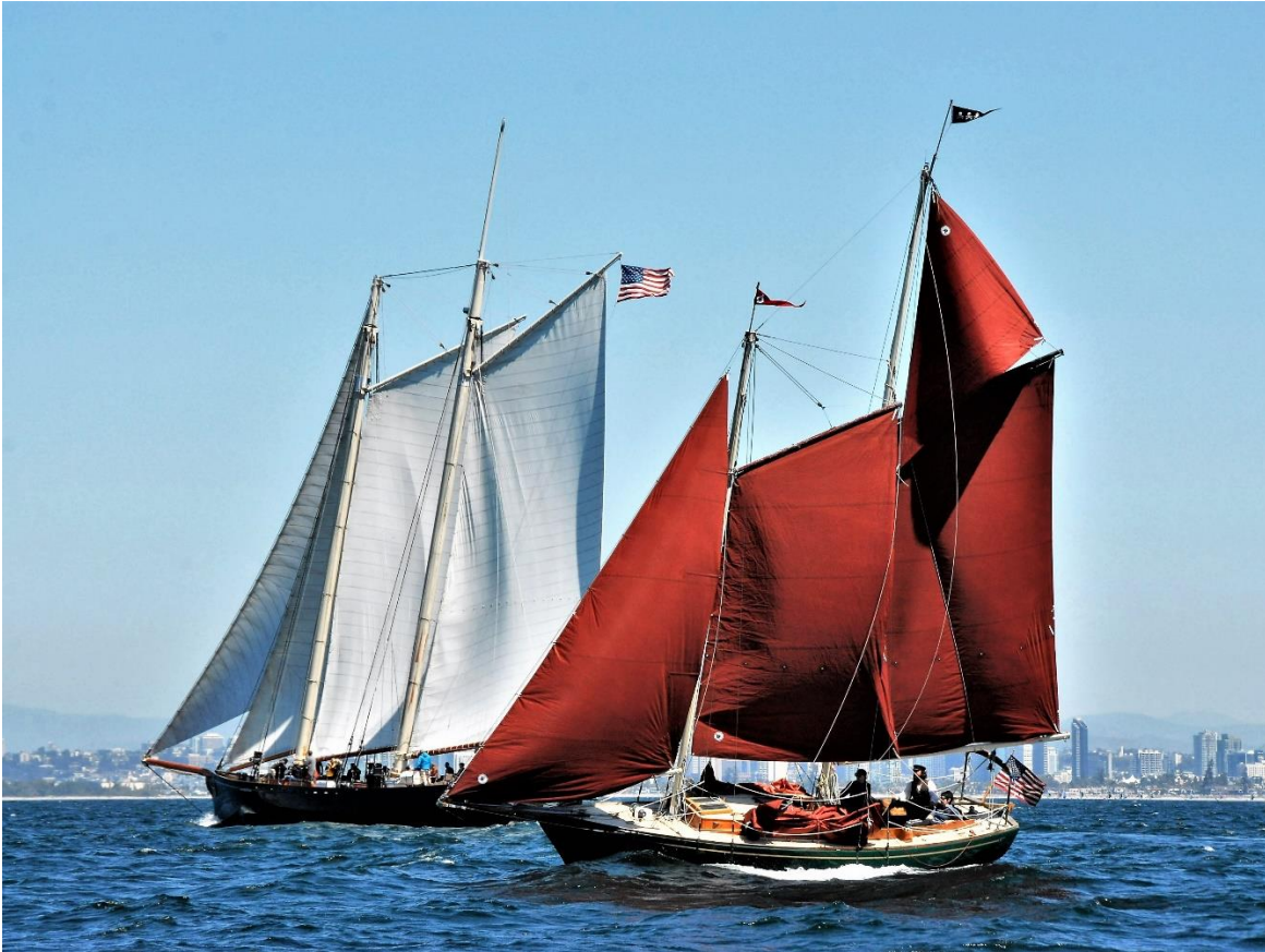
AMERICA & LIVELY