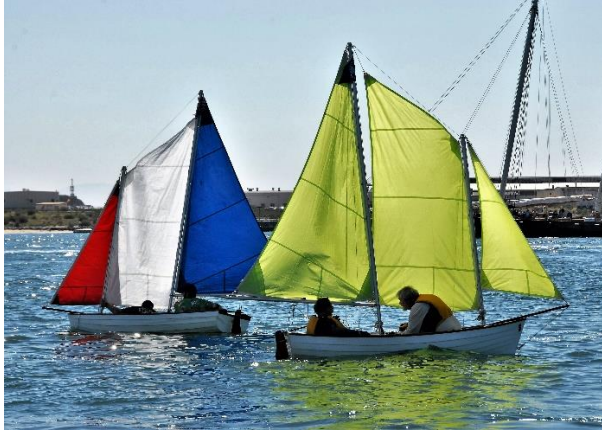
PACIFIER & LIME AN DE COCONUT Dale Frost