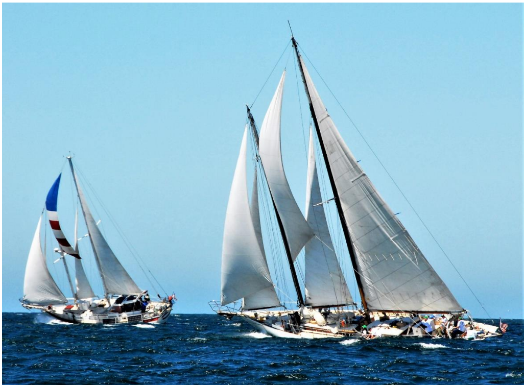
PEGASUS, SKOOKUM III