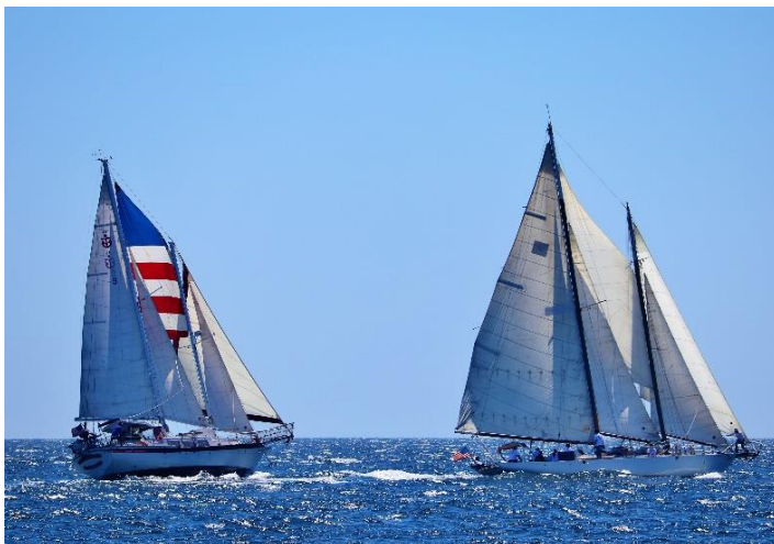
PEGASUS, SKOOKUM III