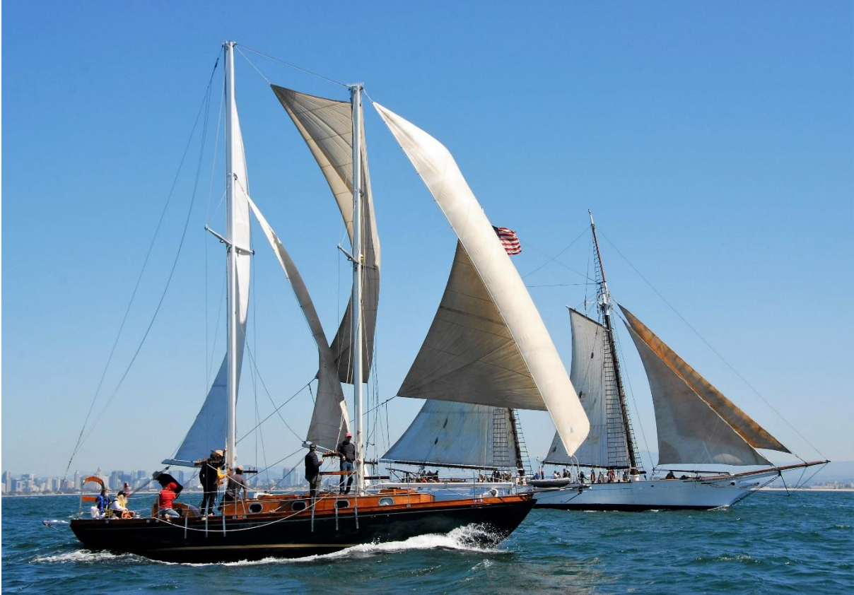
SHINE ON, BILL OF RIGHTS