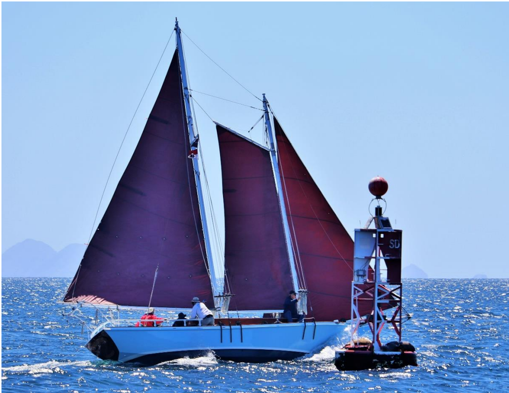
MAID OF KENT