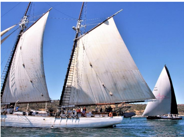
BILL OF RIGHTS