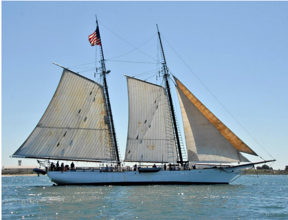
BILL OF RIGHTS