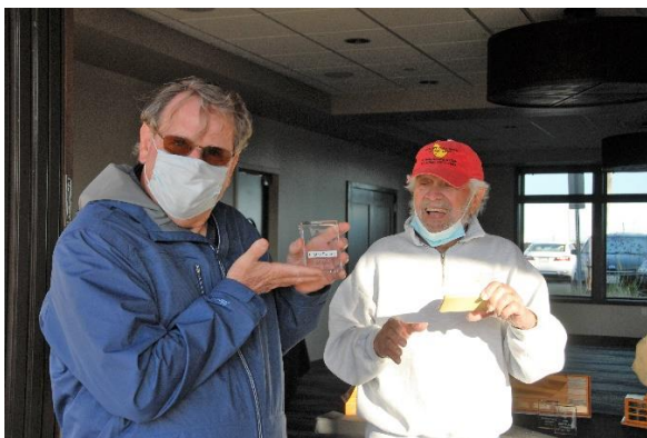
First to Swamp Award!