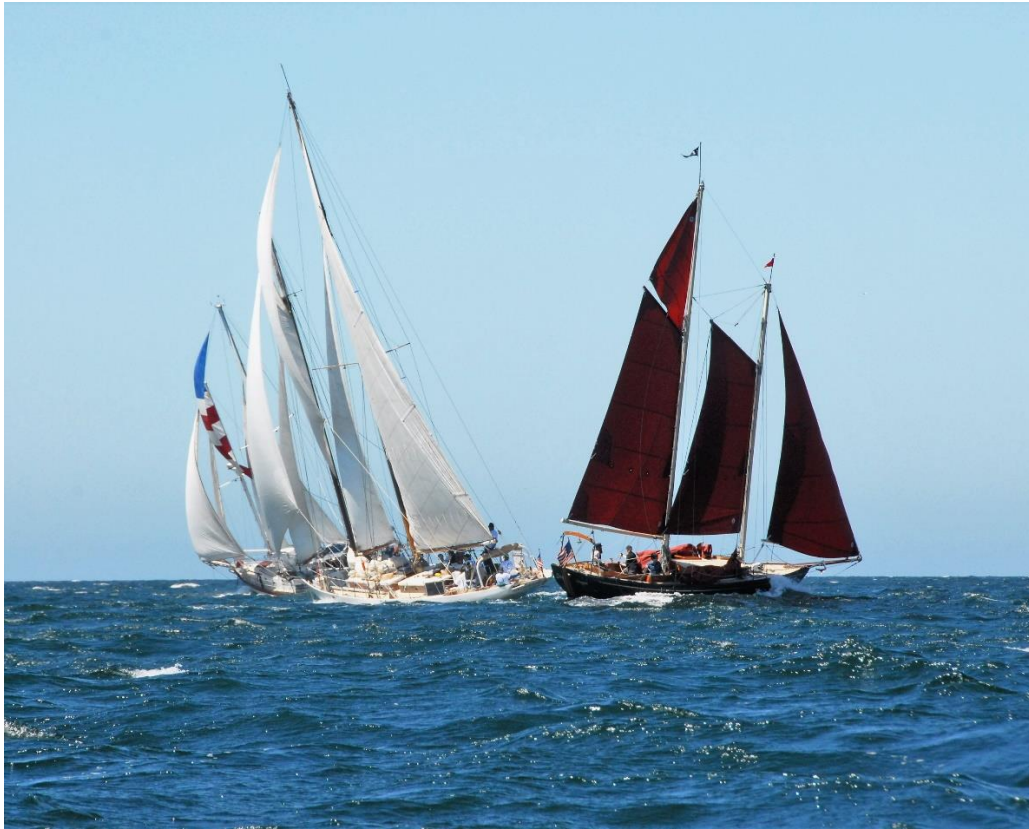
SKOOKUM III, PEGASUS, LIVELY