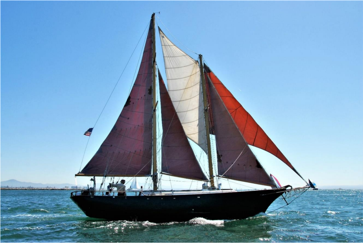
AGE OF GRACE