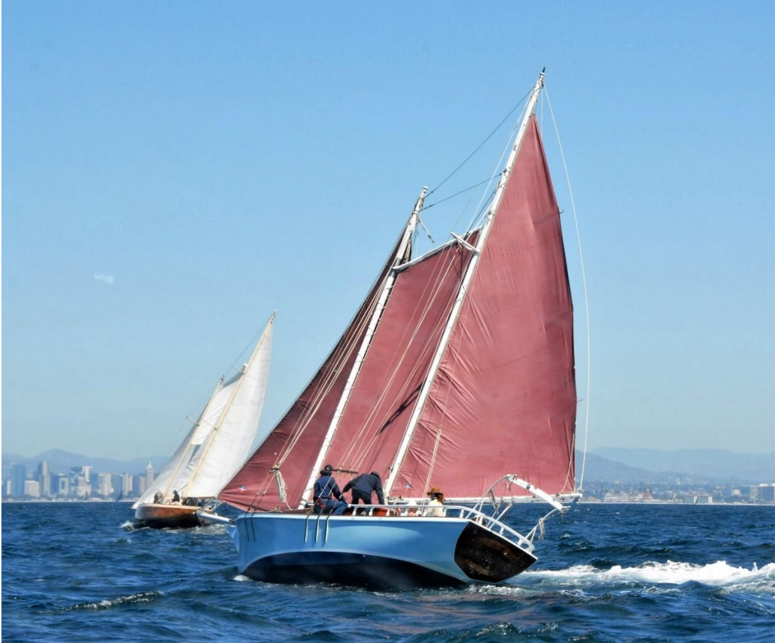
MAID OF KENT