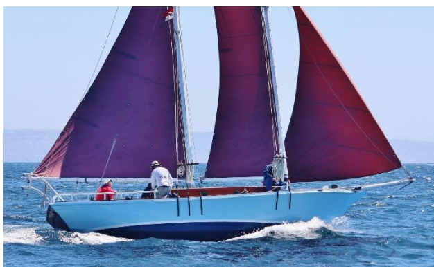
MAID OF KENT