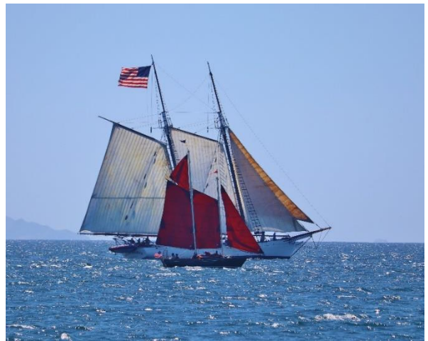
BILL OF RIGHTS, LIVELY