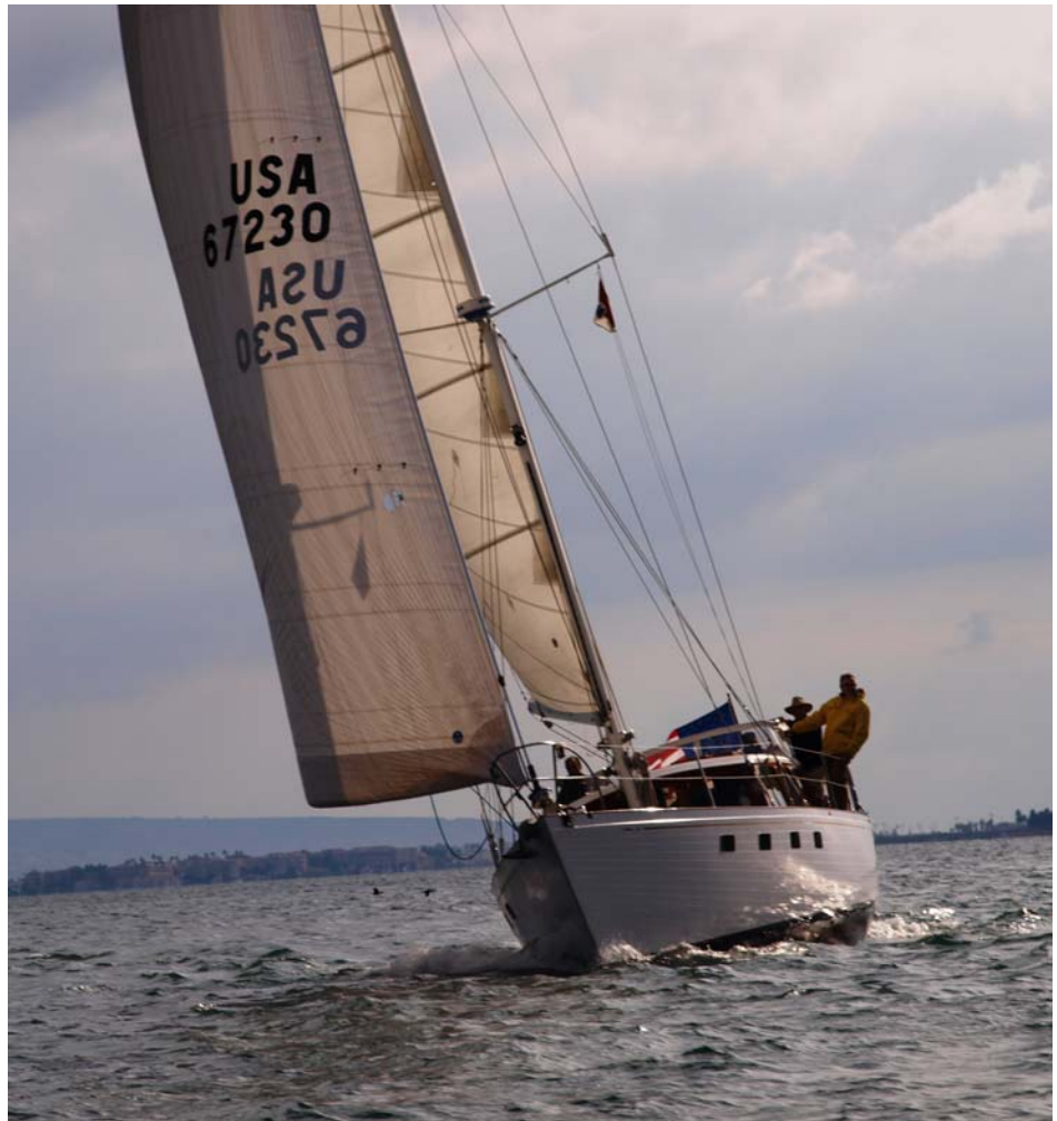
Old Glory, Sailing the 2009 Half-Pint Race

Old Glory honors the American Flag which stands for peace, honor, truth, justice and freedom. Old Glory is a Calkins 50 designed by W. H. (Skip) Calkins and built in 1968 by Tokyo Marine in Yokohama, Japan. It is 50 feet LOA with LWL of 43 feet and a beam of 11 feet 11 inches. It has a draft of 6 feet 6 inches and a displacement of 42,000 pounds. The hull is triple planked 3/8" mahogany with a total thickness of