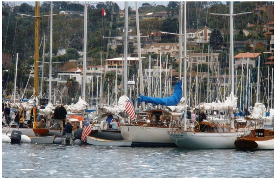
2009 Half-Pint Raft Up (L-R: Sally , Pacifica , Flirt , Sabrina , Circe , NoKaOi )