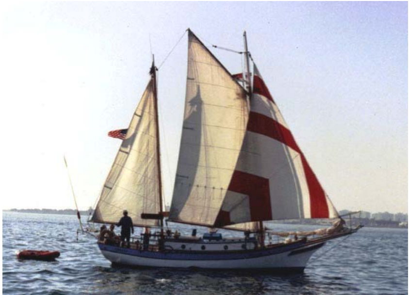
Revelee Coasting in Local Waters