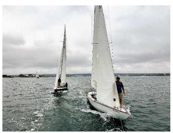
"Tow, tow, tow your boat ... through the windless seas .."