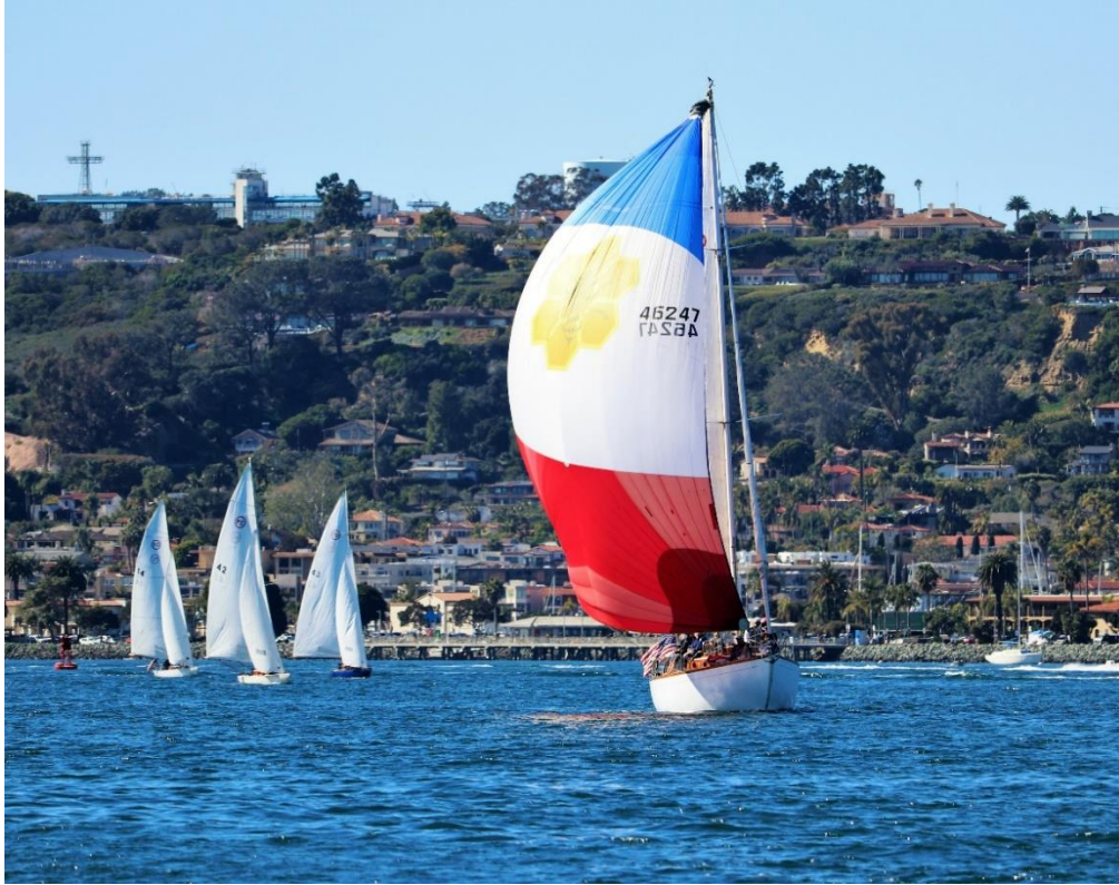
LA CUCARACHA, ZEST, BLUE CHIP. RENDEZVOUS