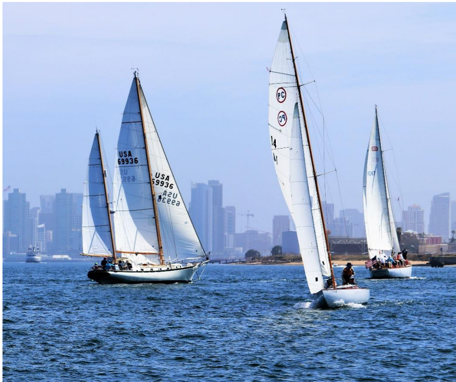
SPITFIRE, LA CUCARACHA, RENDEZVOUS