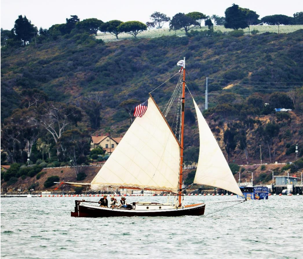
BUTCHER BOY - YESTERYEAR