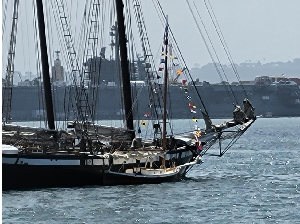
CALIFORNIAN AND BUTCHER BOY