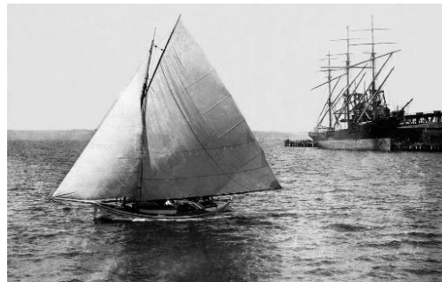
BUTCHER BOY RESTORED