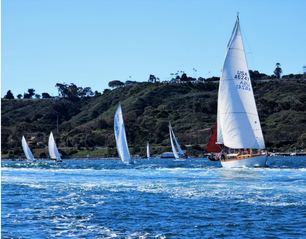
LA CUCARACHA, BLUE CHIP, SPRIG, LOLA, RENDEZVOUS