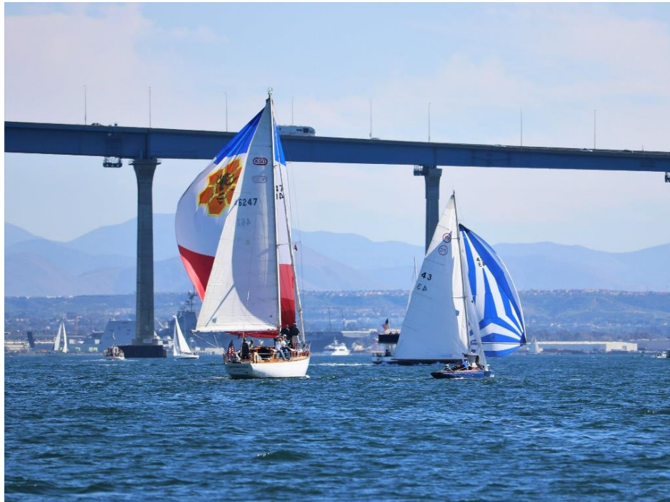
RENDEZVOUS, BLUE CHIP