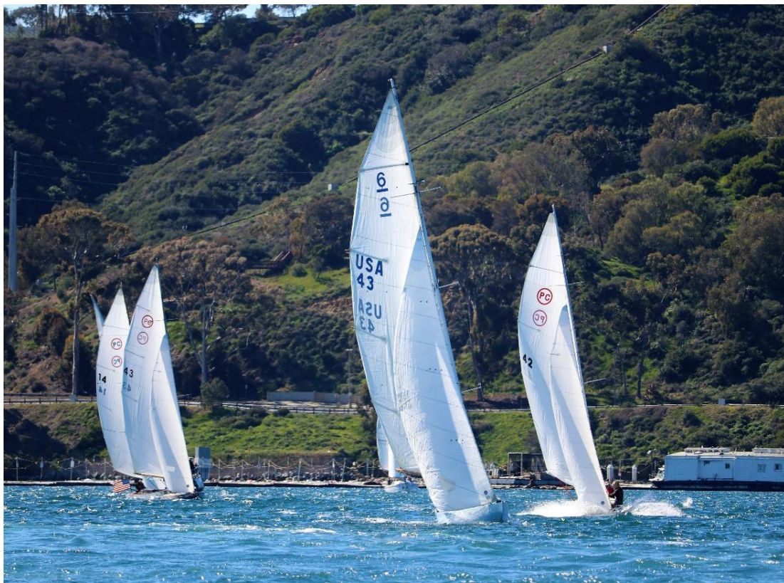
LA CUCARACHA, BLUE CHIP, SPRIG, ZEST