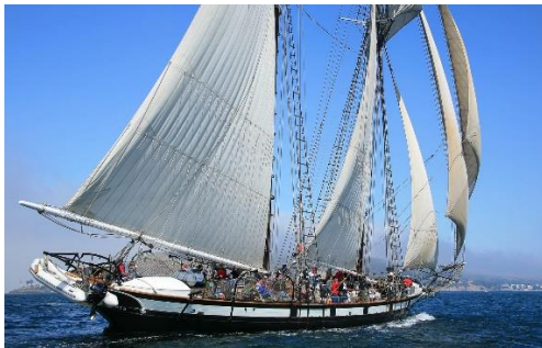
TALL SHIP ADVENTURES