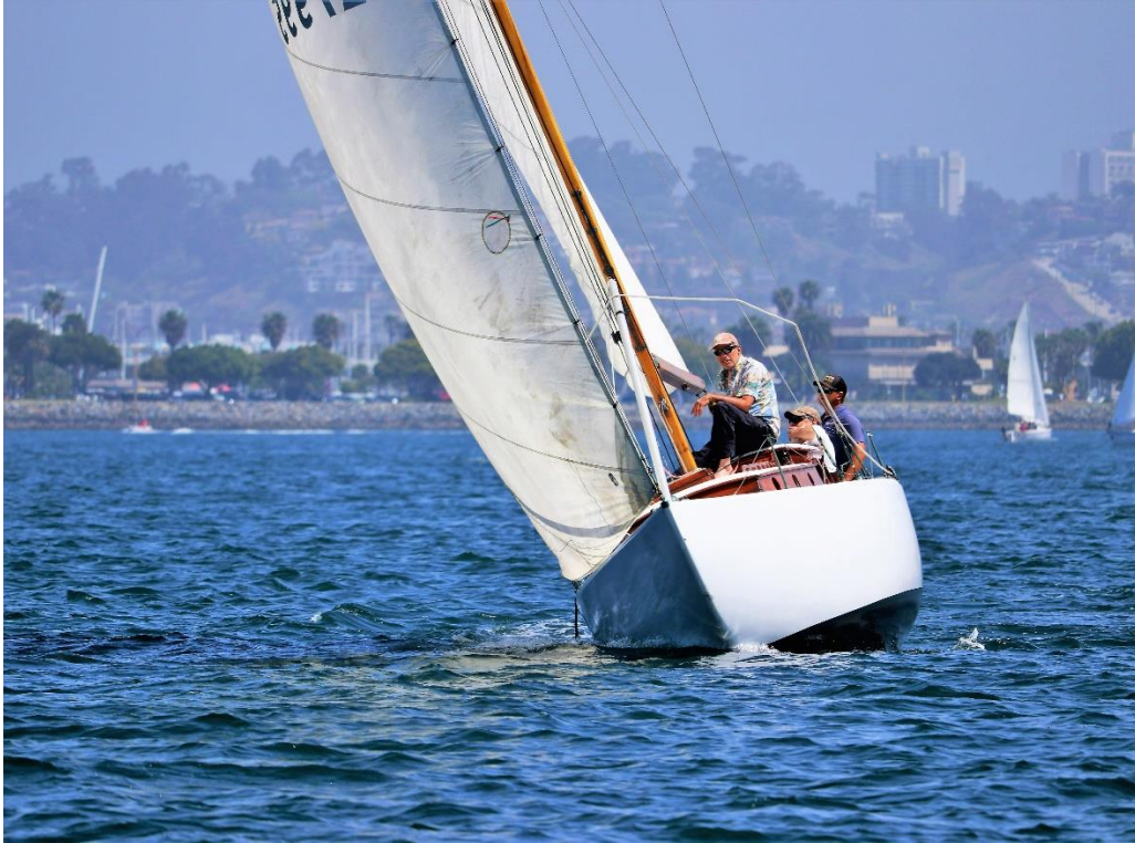
KETTENBURG 38 SPECIAL