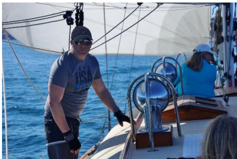
RENDEZVOUS CREW