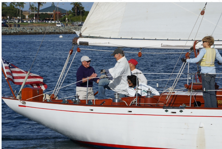
Captain and crew of Freedom celebrate the finish of a well sailed race in the 2014 Half Pint of Rum Race. Freedom finished 1st in Racing Class B - just a mere five seconds ahead of Frolic !

We have a number of exciting on-the-water events planned for 2015. These include the 20 Guinea Cup race series. We expect continued keen interest in this casual race format in 2015. Mid-way through the year, three significant regatta events will fill our late Spring/early Summer calendar during the customary seasonal break in the 20 Guinea Cup race series. They are: the 41st Annual Yesteryear Regatta (May 9); AMSS Commodore's Cup Race (June 6); and the Kettenburg and Classic Yacht Regatta (June 26 - 28). We are committed to each of these regattas as hallmark AMSS regatta events in 2015. Which brings us to another planned tweak: the 2015 Commodore's Cup Race will feature a post-race raft-up and Summer BBQ at Koehler Kraft Boatyard. Details about each of these regatta events will follow in coming issues of the Albatross and at upcoming monthly general meetings.