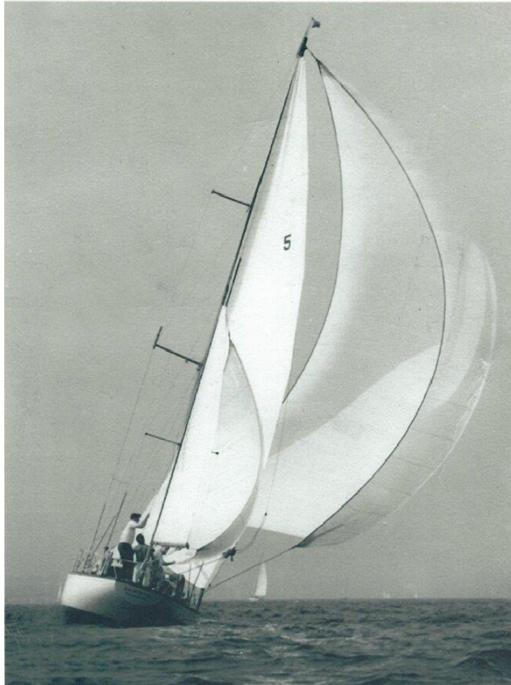
FAIRWYN under original sails