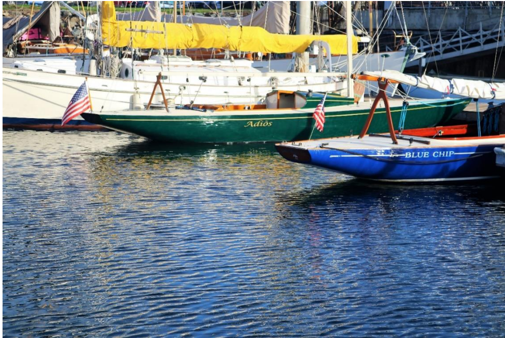
ADIOS & BLUE CHIP