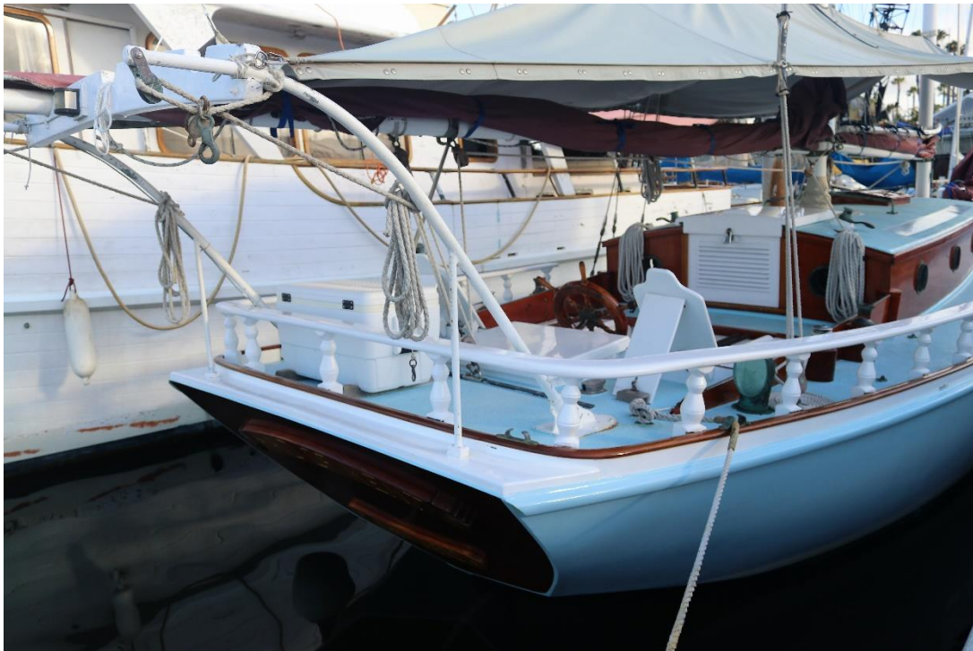
MAID OF KENT