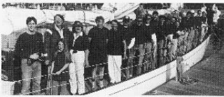
* KONA KAI INTERNATIONAL YACHT CLUB * 13