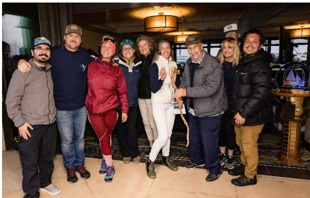
SHINE ON CREW