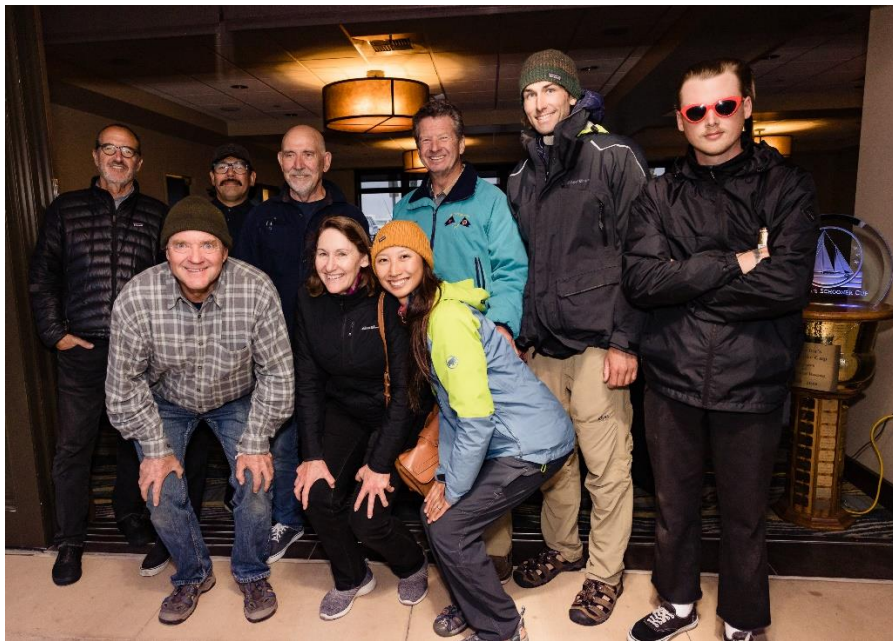
LA VOLPE 2022 Schooner Cup WINNER!