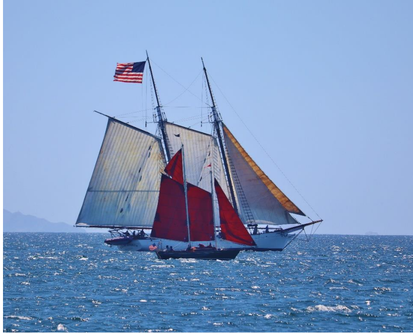
LIVELY & BILL OF RIGHTS