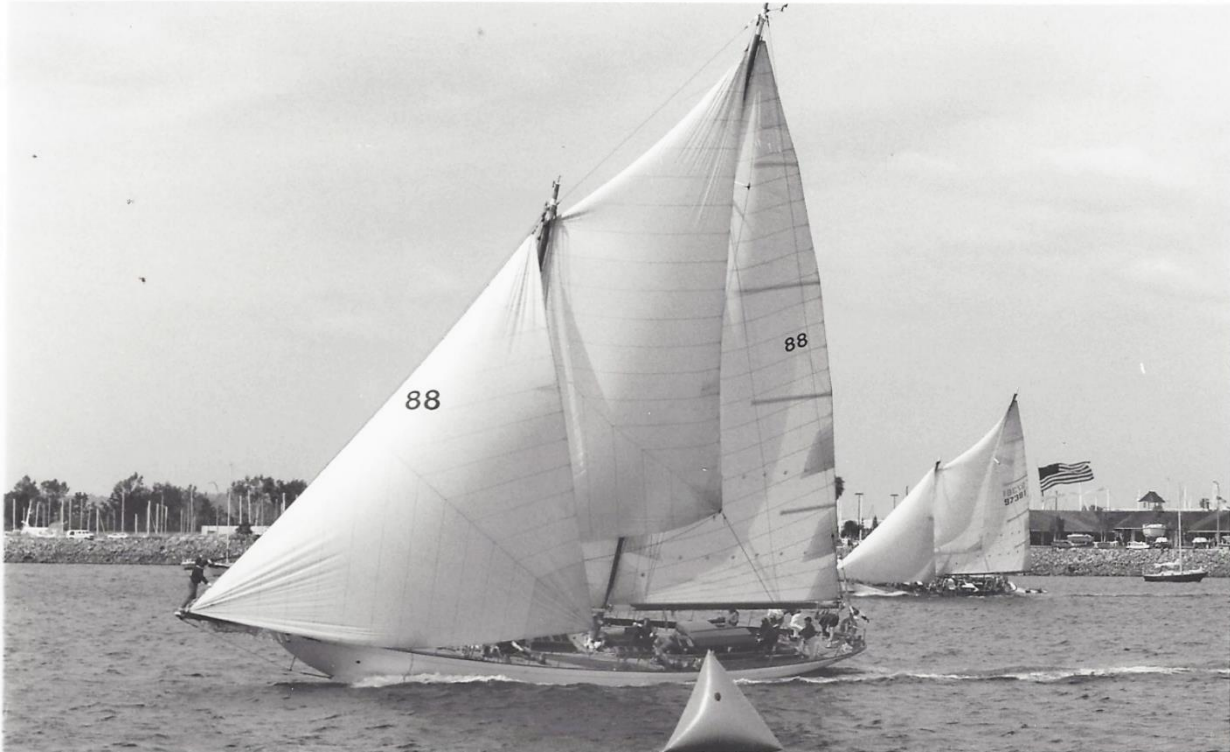
ASTOR FIFE SCHOONER LAUNCHED 1923 FAIRLIE, SCOTLAND