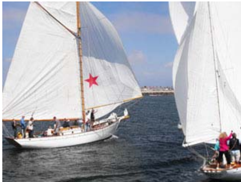
Bequia and Circe Bow-to-Bow at the Finish of the 2009 McNish photo Courtesy The Log