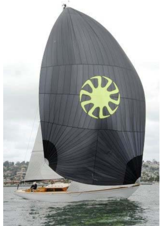
Chimaera on a Light Day

Chimaera and Endymion will be at the front dock at the SDYC Thursday evening, so please come early to see these boats before the program. There's a message in to Dennis Conner, who we hope will add