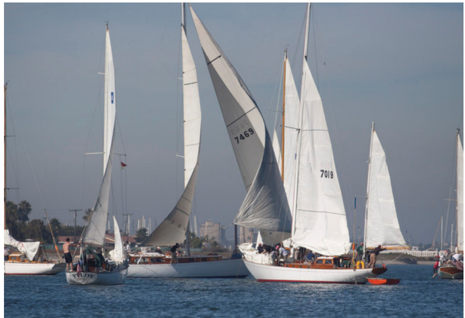
Half Pint o' Rum Racers hoisting sails for the start