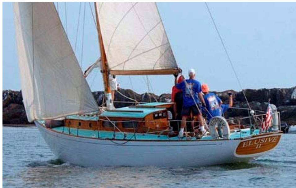
Don Greene's Elusive II