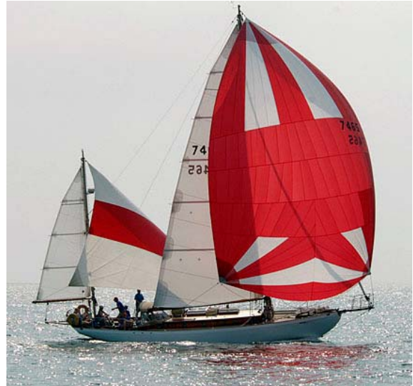
Cheerio II during the 2007 Mc Nish Classic