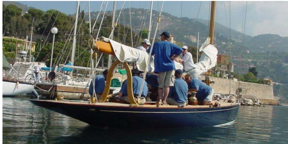
Cotton Blossom, getting underway for another race

Dennis Conner reports: "Folks, We finished the Cannes regatta yesterday which was the last of the Panerai Series . In the big picture we sailed 4 regattas averaging 120 boats all built before 1949. We won 2 of the 4 series both in our class, and overall and received the special Panerai watch as a symbol of excellence. We won our class in the other 2 events meaning we won all 4 regattas in class. We sailed 11 races and won 9 in our class. We were not racing against Tamara IX or Cholita as they rate 35 seconds per mile slow, putting them in another class. Bonafide of course is in the gaff division so we do not sail directly against her. She is very tough to beat and beat us 6 times on corrected time. We beat her 5 times. Our performance was generally well received although they hit our rating twice, lowering us from 108 seconds per mile to 76 seconds per mile, a 33 second per mile penalty for no reason as we did not change the boat in any way. I will leave the boat in France for the winter. I plan on offering her for sale in the sailing magazines in the spring with hopes she will sell. Miss you all and will be home by Thanksgiving. cheers dc."