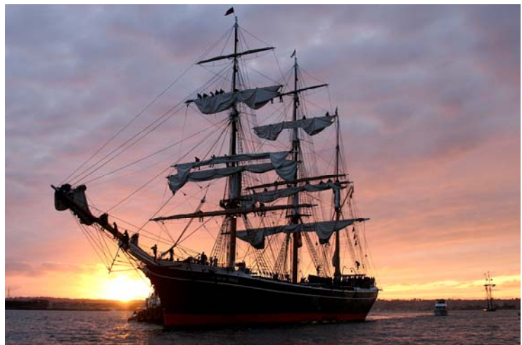
The Star of India , with crew aloft to furl after last year's sail