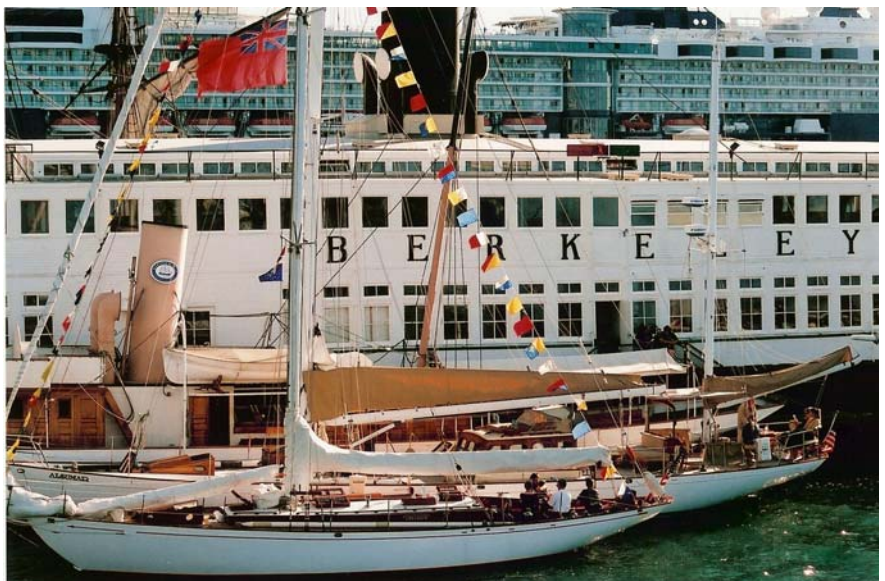
Freedom and Alsumarrafted up alongside the Steam Yacht Medea