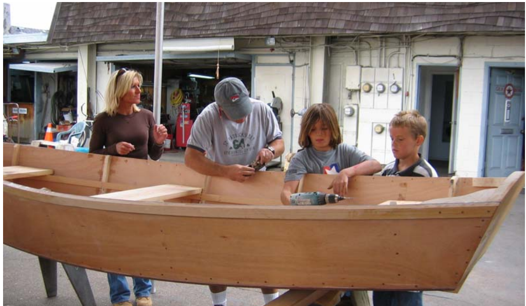
A new Bevins Skiff, on Day Three, almost ready to float