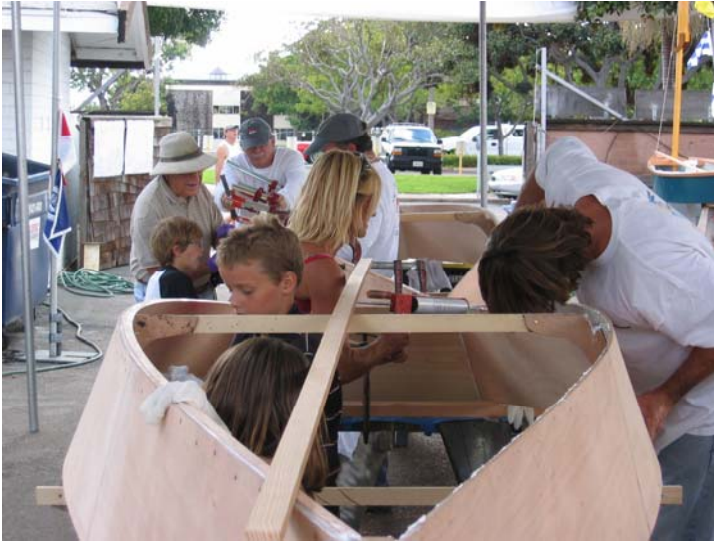
Ready for the bottom, on Day One