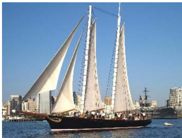
America underway in the bay, with the Embarcadero and U.S.S. Midway in the background