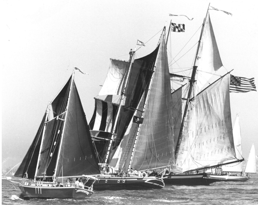
Maid of Kent and Rendezvous escort the late Pride of Baltimore (lost in the Atlantic, 1986) into S.D. Bay in 1982. Pacifica is to leeward. Pride of Bal-