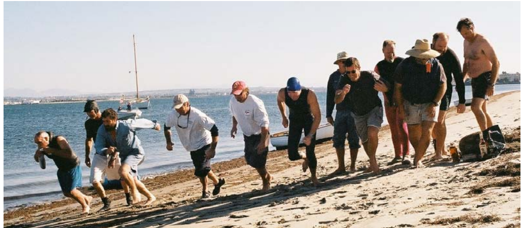
They're Off! Starters moving out on signal, some nearly tripping over the keg

The morning was a typical San Diego December day, bright and warming up quickly, with hardly a drop of dew on deck. This year's Half Pint race brought 22 boats out, motoring or catching a tow to the start line down on the Silver Strand. The race committee inspected the entry fees (rum), supervised charging of the official keg and sounded the start.