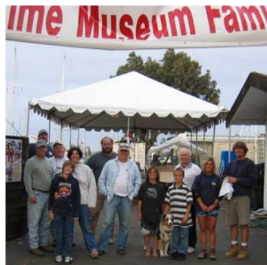
Family Boat Building