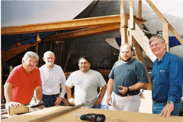
The Gang at Traditional Boat Works

Before we forget, a few photographs from last year's favorite AMSS races and events: