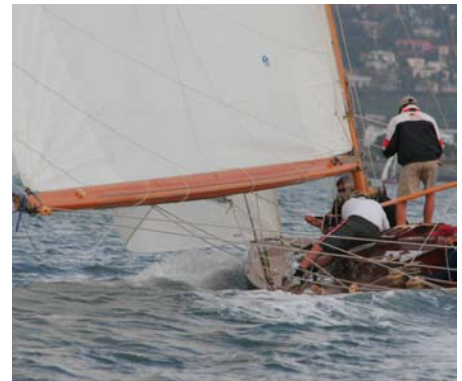
Cotton Blossom Tuning Up