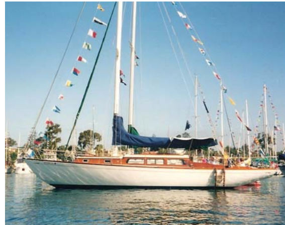
Avanti, showing colors