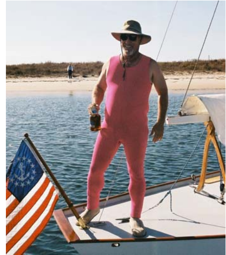
A potentially ribald contender for "best dressed" in last year's Half Pint race

One of the perennially favorite (since 1974) Ancient Mariners events is scheduled for this Saturday, 2 December—the Half Pint-'o'-Rum Race. This race is open to Ancient Mariner Boats and invited guests. The entry fee is a fifth of premium rum that will be decanted into the AMSS keg. The Race Committee has great latitude to assess penalties as well as time awards for exceptional seamanship, gaudy costumes, etc. Be forewarned that poor quality rum will be penalized, and in extreme cases, could be cause for disqualification, or significant handicap adjustments.