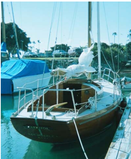
Caprifol at Rest