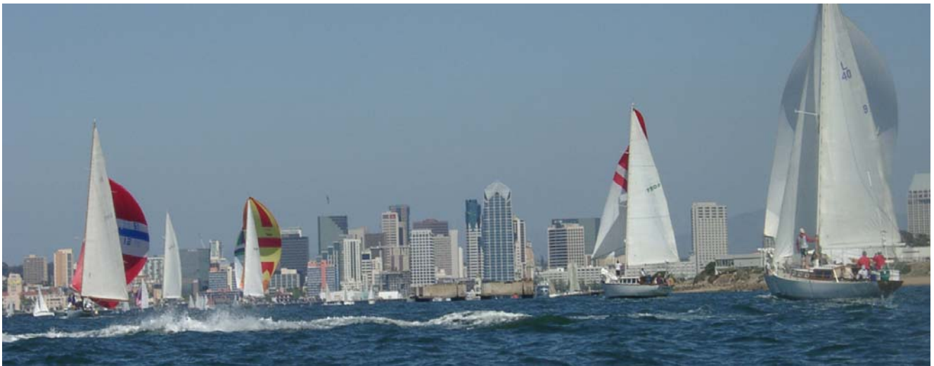
Inbound to the Embarcadero, in an Earlier Yesteryear Regatta

Classic sailboats from ports ranging up and down the West Coast typically gather for this Regatta, and compete in six classes. The types of boats racing usually range from daysailors through ocean racing yachts and large gaff rigged schooners. The best viewing locations ashore are from Harbor Island, Shelter Island, Point Loma and the downtown Embarcadero.