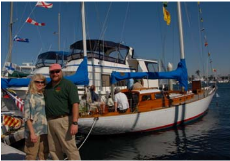
Happy Birthday, Pacific!