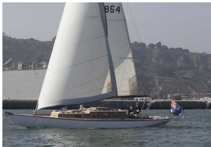
Benchmark , off Point Loma