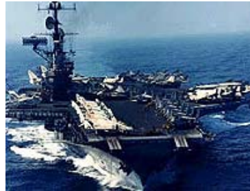
USS Midway, CV 41