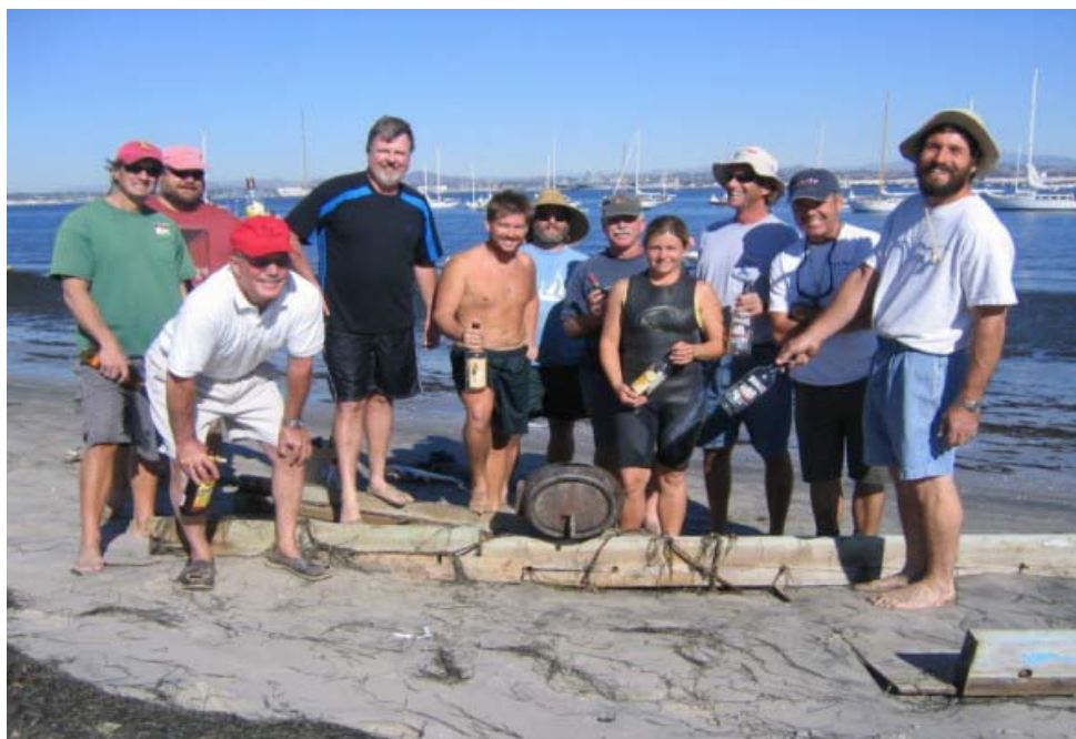
Some of the Stalwarts Surrounding the Keg, Before the Start