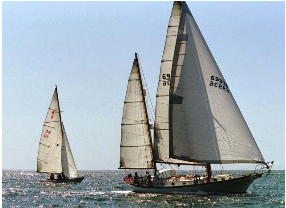
Spitfire , 1 st in 20 Guinea Cup #2 Race (Long Course), inbound with Altair in chase