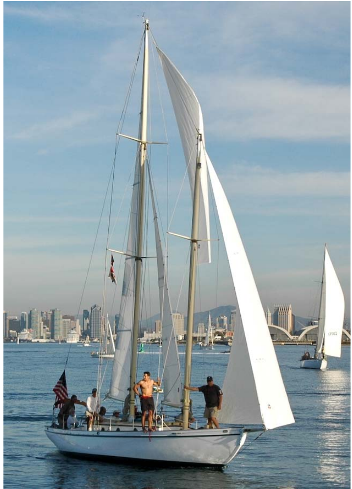
Mischief Ghosting Along During an Ancient Mariners Half-Pint o' Rum Race