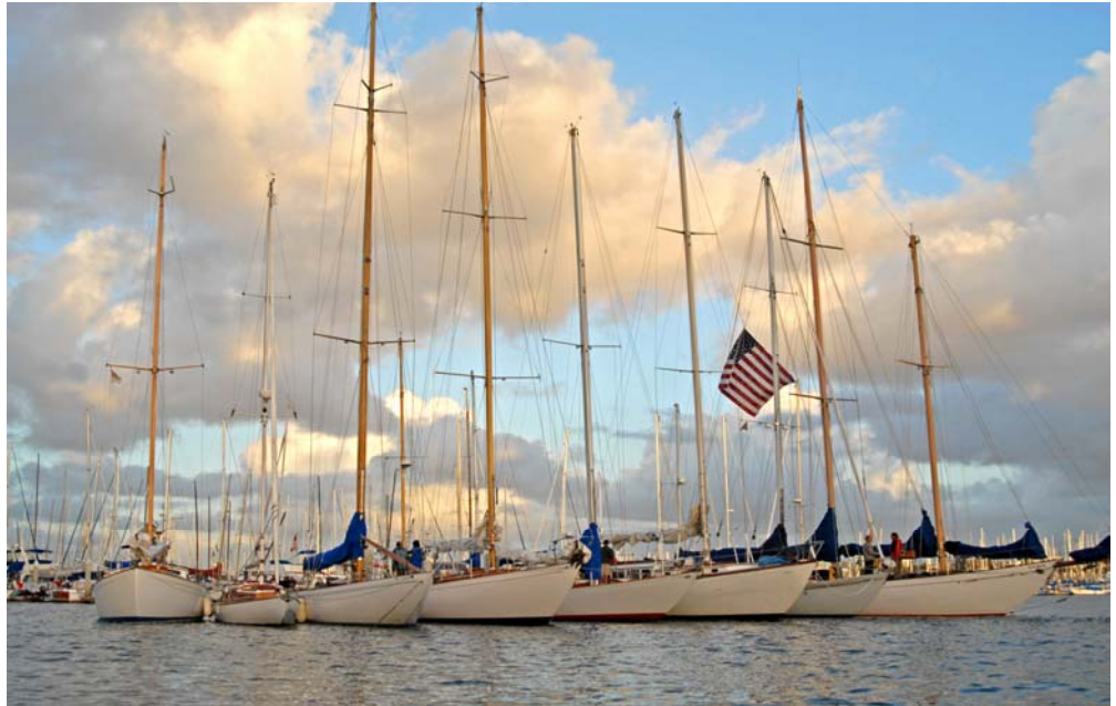
A Memorable Raft-Up After the Half Pint

The 2009 Half-Pint-o'-Rum Race will be sailed on Saturday, 5 December. Opinions are torn as to whether the Yester-year Regatta or the Half-Pint is the most favorite race every year. Certainly, there is keen interest on the part of all crews participating in the Half-Pint to have as much fun as possible. As most know, this race involves a running start off the Silver Strand beach in South Bay, skippers making it back to their boats by any feasible means (swimming, surfboard, kayak, dinghy, etc.). Anchors can be raised and sails hoisted only as the skipper reaches the boat. The finish, involving the debarkation of skippers off Shelter Island, is also entertaining. They must make land, approach the race officials and rum keg at the finish, and down a swig to be recorded as their official finish time. Plan now to join us in this great race!