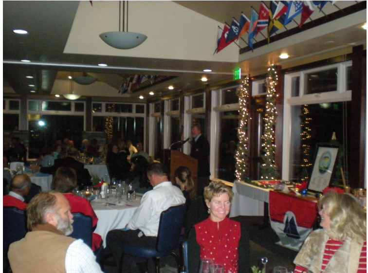
The Main Dining Room with Guests

The annual prize giving followed the dessert with prizes for the 2010, 20 Guinea Cup series for racing class A and a new perpetual trophy for racing class B was introduced and presented by the Commodore. Prizes for the short course were also awarded.