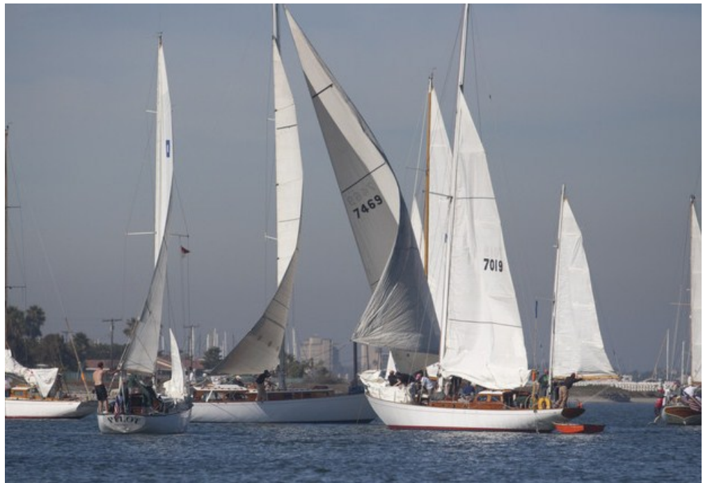
Half Pint o' Rum Racers off the beach, anchors up and sails are hoisting for the start ...

The 2010 Half Pint o' Rum Race sailed on the most beautiful San Diego Winter day that you can imagine. Not a cloud in the sky, warm with a nice breeze filling in mid-morning, and strengthening for the duration of the race. There's no wonder that this event is certainly one of our most favorite! Greg Stewart headed up the Race Committee, hauled around aboard Gatsby . As usual, they collected gallons of high grade proof rum and charged our wooden keg (originally donated to the club by Pussers', and now of dubious repair). Various schemes were used by the racers to get their starters back to the boats after the horn, and a mild mayhem ensued with sails running up, while anchors were raised in haste and big hulls fell off this way and that. There was a near match ...cont'd, pg. 7