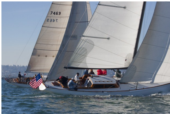
Chimaera and Brushfire

...race between Conner's Brushfire and Driscoll's Chimaera from start to finish, with Chimaera finally taking 1 st in the Racing Class. Brushfire finished 2 nd , and Koehler's Sally finished 3 rd . In the Cruising Class, Freedom stepped right up to 1 st , with Pilot and Benchmark finishing 2 nd and 3 rd . Jada , Windley and La Cucaracha placed 1 st , 2 nd and 3 rd , respectively, in the Sailing Class (those without start and finish swimmers on the beach). Overall, there were twenty six competitors, which definitely made an impression on the Big Bay during an otherwise fairly quiet day.