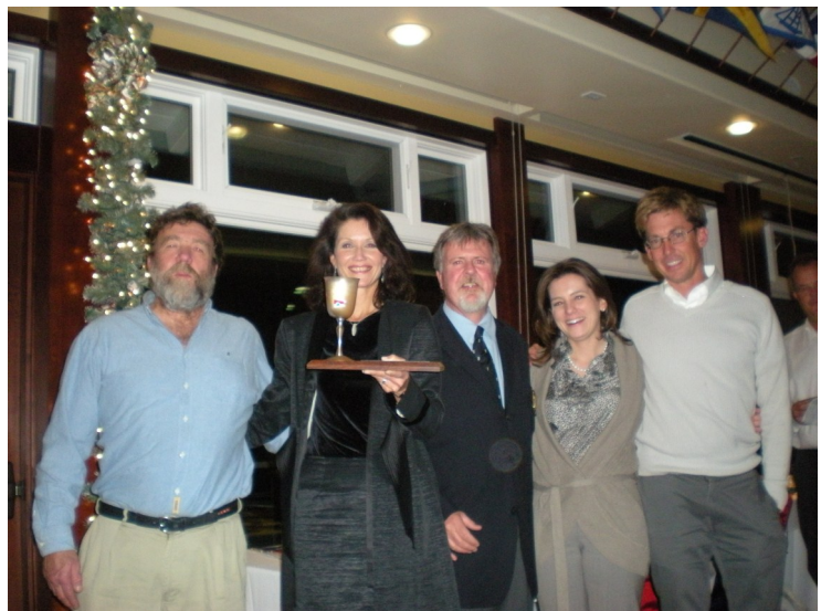
Altair Crew Receives the 20 Guinea Cup Class B Trophy